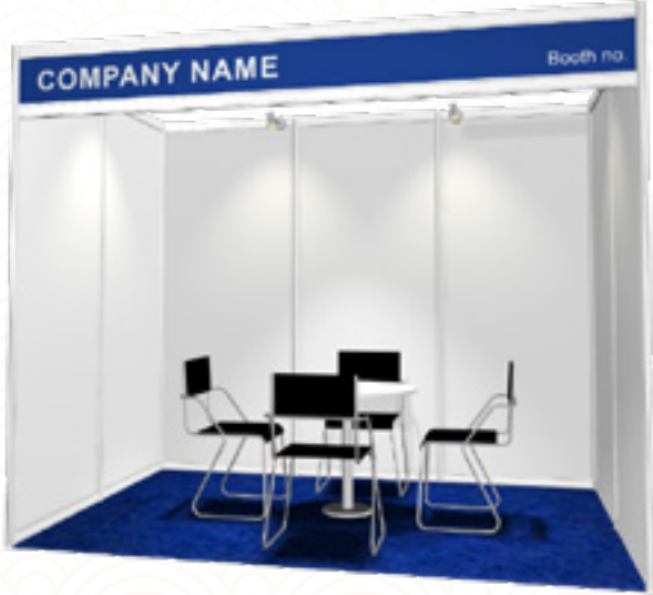
1 open side