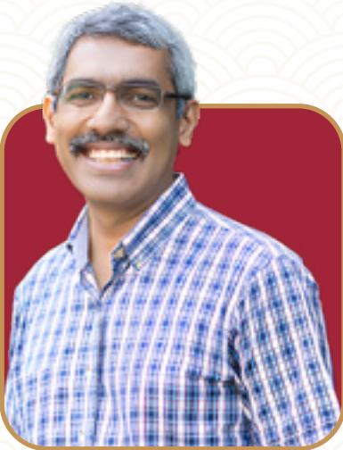
President of the Asia-Pacific Association for International Education

I encourage you to take full advantage of all APAIE 2026 Hong Kong has to offer, as a delegate, sponsor, exhibitor, and presenter. Furthermore, I hope you extend your stay to explore the remarkable city that is Hong Kong.