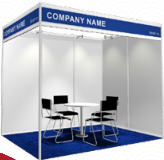
2 open sides