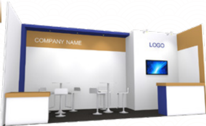
1 open side