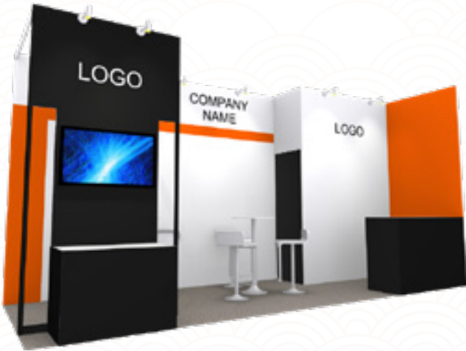
2 open sides