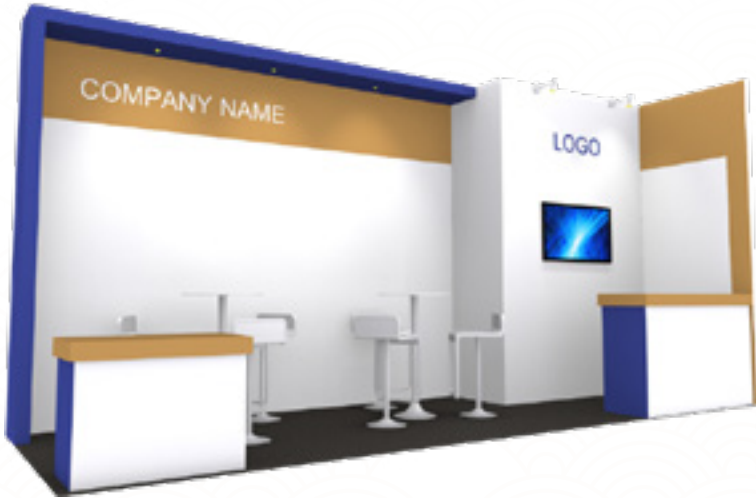
2 open sides